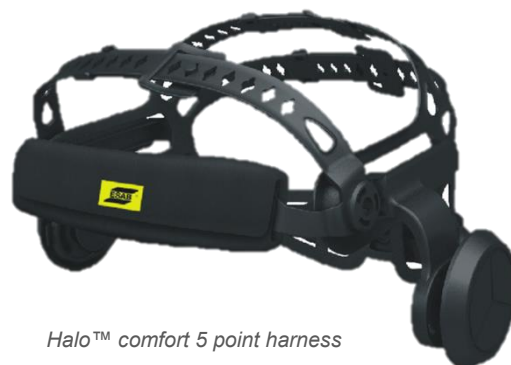
Halo™ comfort 5 point harness (Front view)