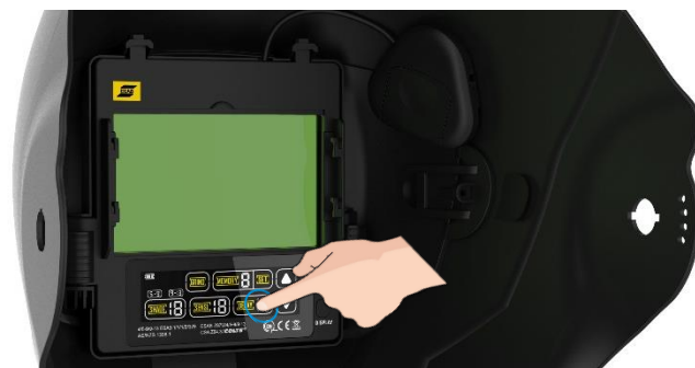
High optical class ADF, with colour touch screen interface