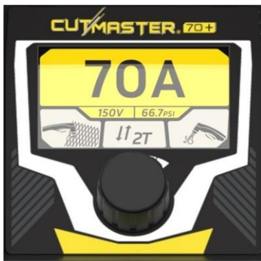
Simple and intuitive TFT LCD panel